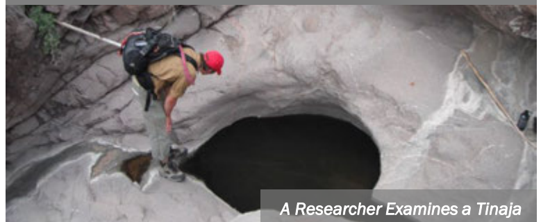
A Researcher Examines a Tinaja